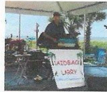
Laidback Larry 11 to 2